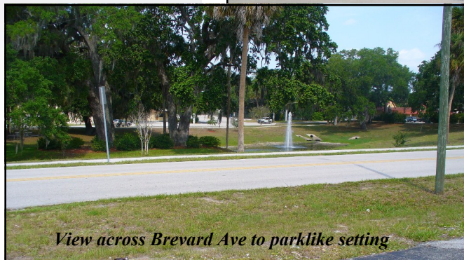
View across Brevard Ave to parklike setting